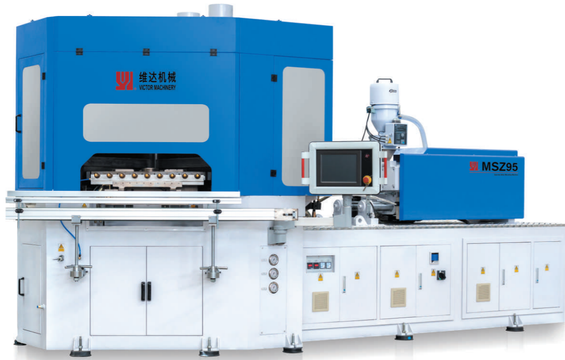
设备尺寸 Machine Dimension